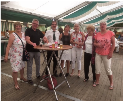
The refreshment tent