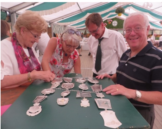
And the winner is ....