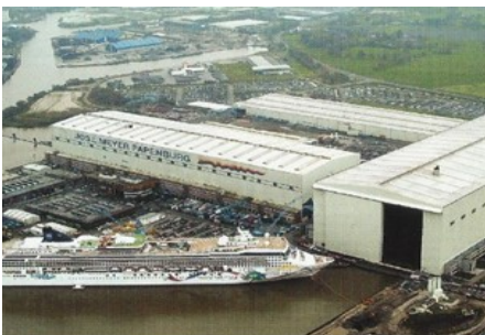
Schiffbau in Papenburg

The main objective however was to visit the biggest covered dry dock in Europe at the Meyer Werft shipyard. Inside the enormous buildings were two large cruise ships under construction at the same time, including Norwegian Pearl – 93,000 tons. I was intrigued to see the construction technique as all the cabins