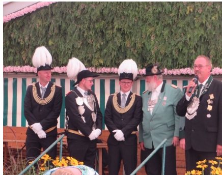
The Schutzenfest King's chain of office