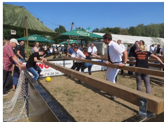
Real life football